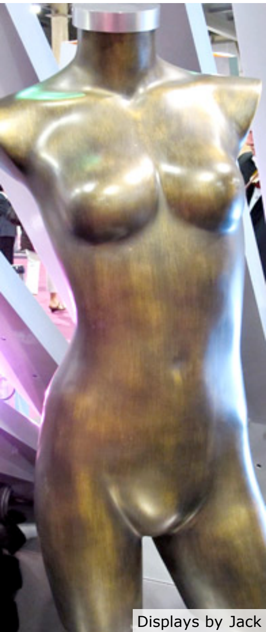
Displays by Jack